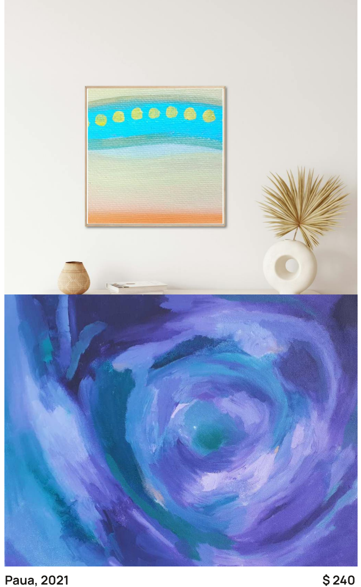
Paua, 2021 Acrylic I 35 x 45 cm