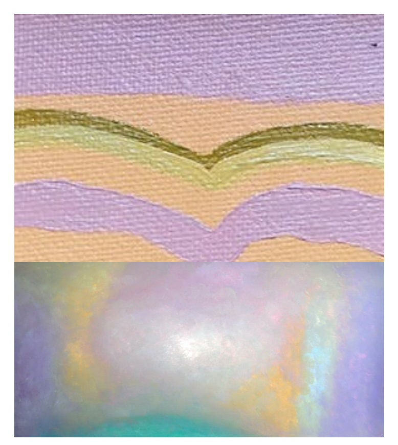
Reflections, 2013 Acrylic | 75 x 150 cm