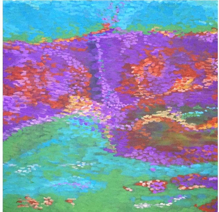
Springs, 2018 Acrylic | 51 x 51 cm