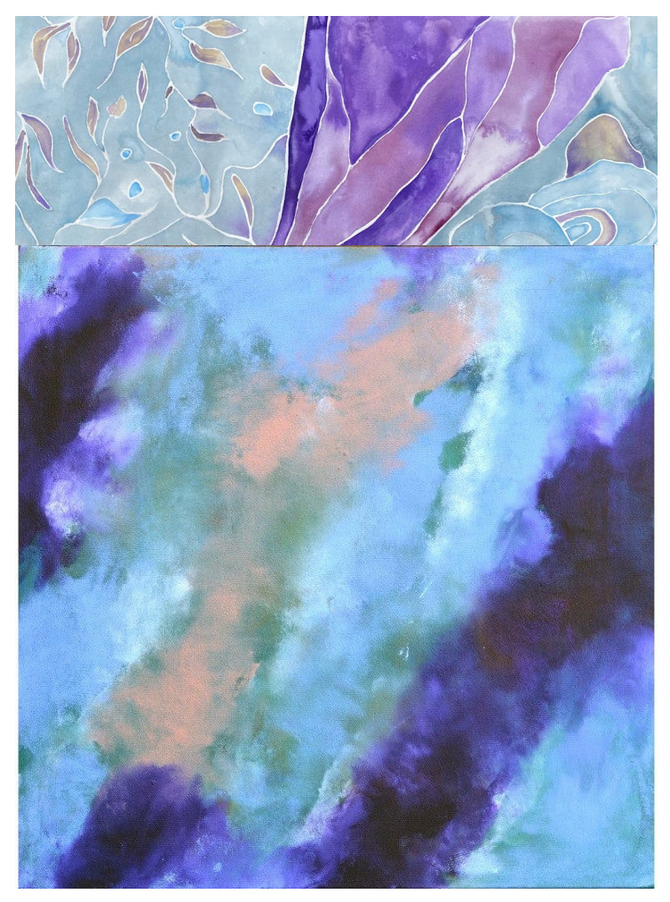
Revival, 2014 Acrylic I 35 x 35 cm