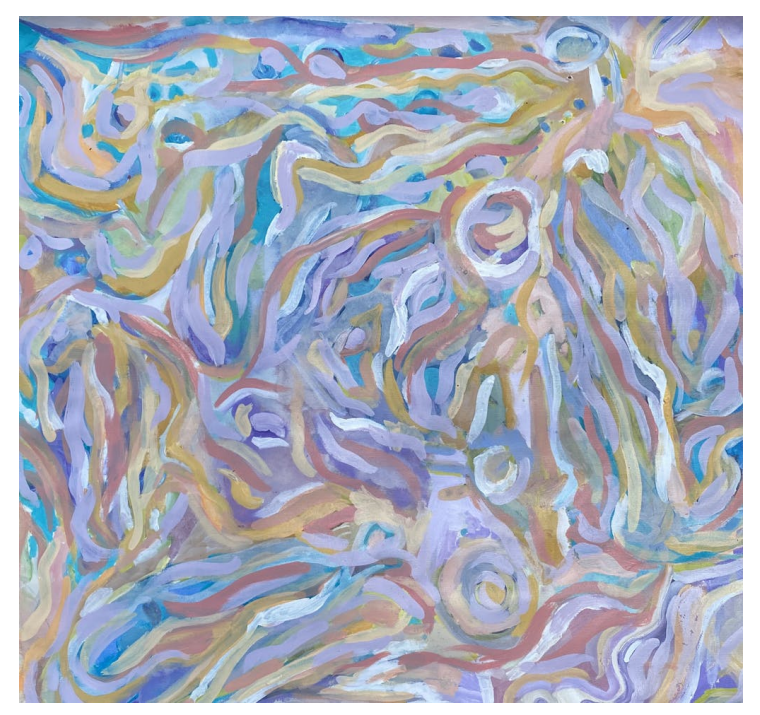
Road Trip, 2023 Acrylic | 71 x 71 cm